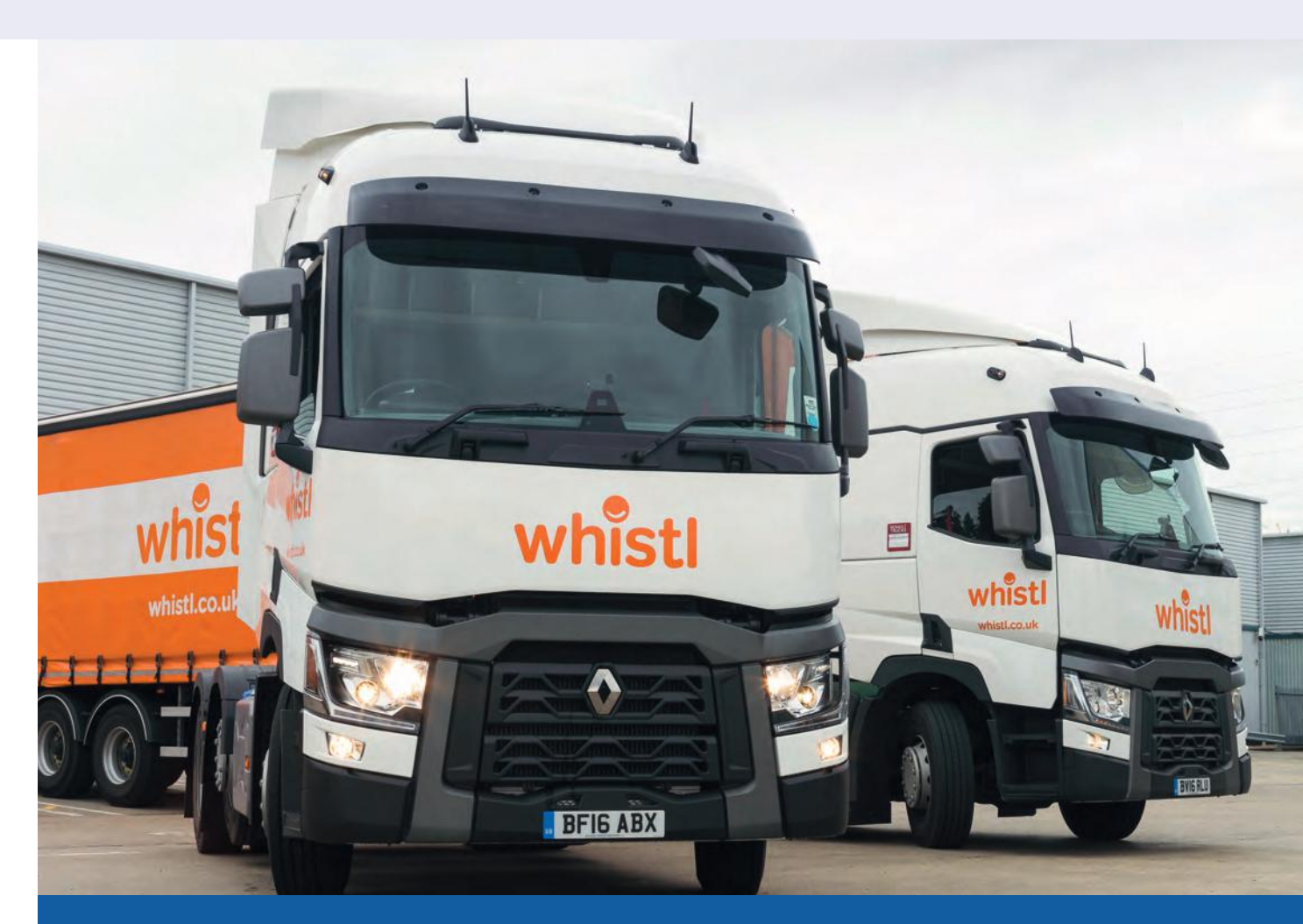
"I like the way the Dimensional Insight team thinks outside the box. When you're in the midst of business, your thoughts tend to follow certain patterns." - Lieneke Happel, IT Director at Whistl UK Ltd

Once the foundation was in place and the main reports had been defined, the project team began migrating all source files from the old platform to the new one. During this process many unknown and illogical exceptions were found, such as ill-documented customer-specific discount rules. It took some time to figure out how to include them in the new solution.